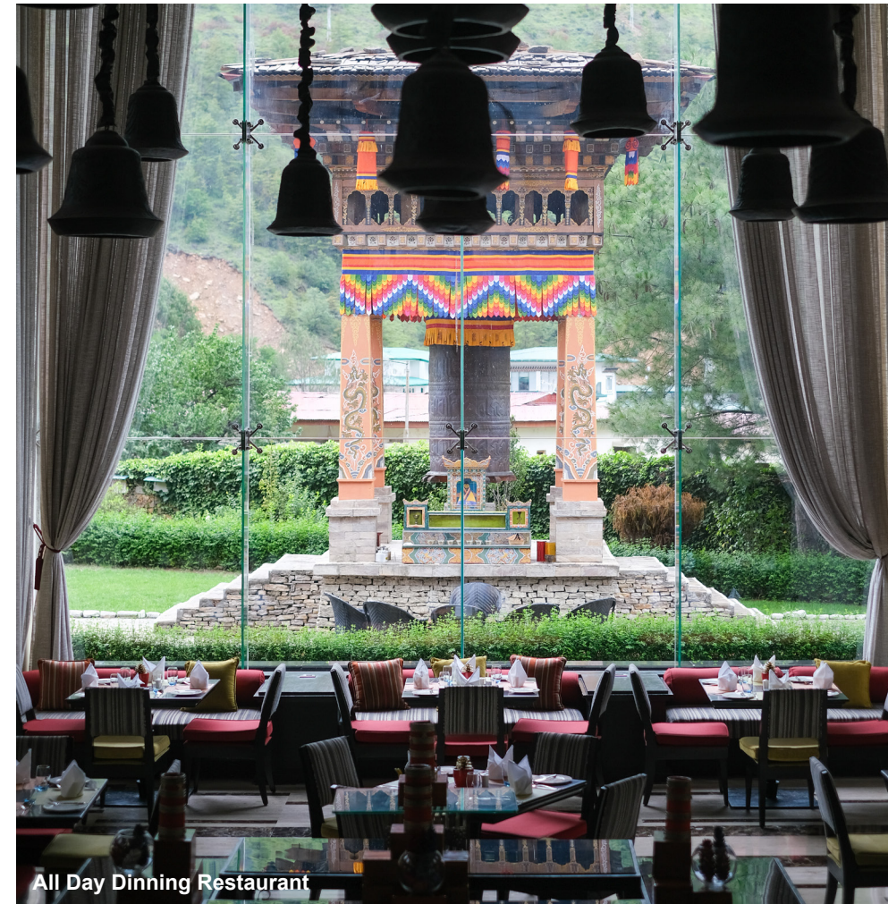
All Day Dining Restaurant